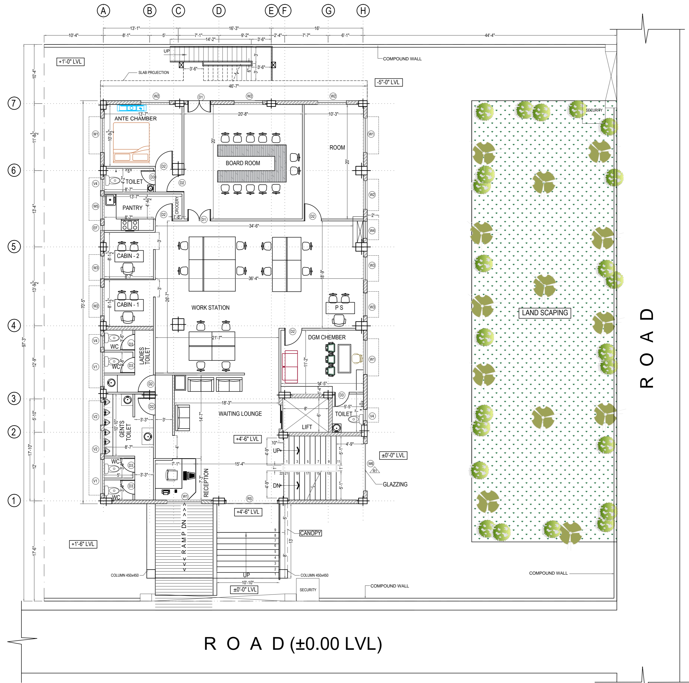
GROUND FLOOR PLAN(+4'-6" LVL)